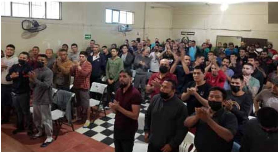
Alcoholics Anonymous, continued...