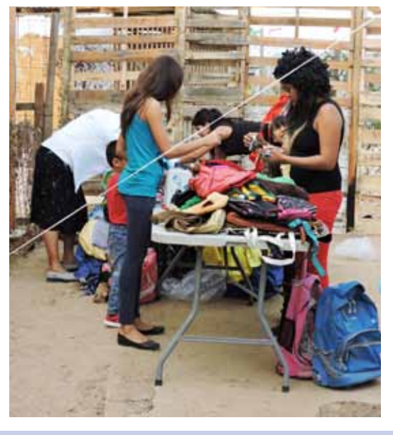
Tierra y Libertad